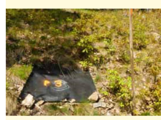
Photo 5 (Incorrect!): This black foil is thin and can easily be damaged. Again, it has an unsuitable shape and is poorly installed. By removing more of the load, the reptiles will soon be scared off and easily escape.

Photo 4 (Incorrect!): The foil placed in this way is an unsuitable solution for several reasons. The transparent foil does not act as a shelter on the reptiles, it is laid on the mature vegetation, which will mold under the foil, thus again an environment unsuitable for reptiles. Its size is also undesirable. The elongated shape, which must be attached in the middle, does not allow quick and easy inspection. More complicated handling of the stones would scare the animals under the foil, so that even in the case of a more suitable shelter material, the occurrence would not be verified.