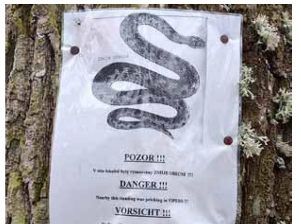
Photo 1: A poster "warning" of the alleged planting of vipers appeared in the Třeboň region. This is a false and alarming message, and therefore such calls are always without mentioning the author or other verifiable source.