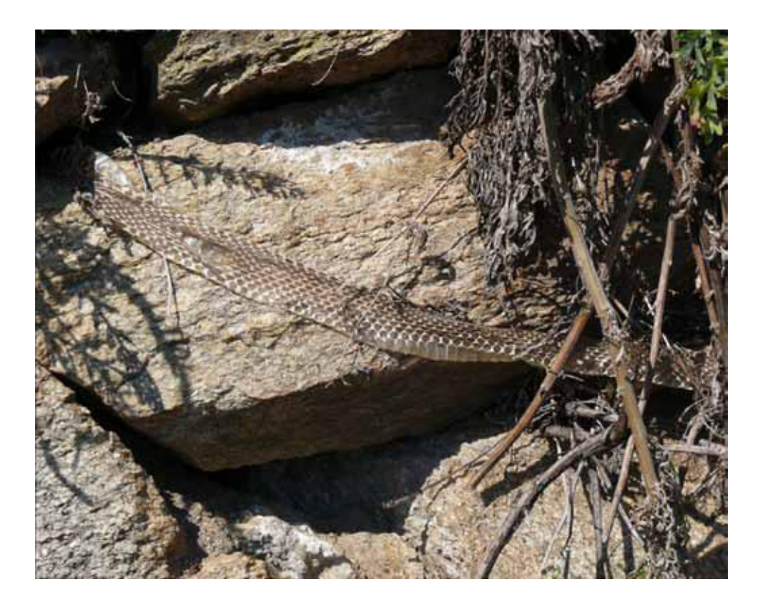
Photo 2: Preserved exuvia (slugs) of snakes can usually be well determined, so they are credible evidence of the occurrence of the species.

It is mainly about catching birds or bats in nets or small mammals in traps. By standardizing these methods, it is possible to obtain good quantitative results which can be statistically evaluated. These methods have been relatively standardized, for example, in small mammals (eg Pelican 1975). For example, CES (Constant Effort Site) and RAS (Recapture of Adults for Survival) methods use bird capture in nets combined with ringing. At present, mammalian trap-mark-recapture (CMR) is being widely used. The use of these traps has the advantage of less intervention in the studied populations (Wilson et al., 1996). This method is also used for reptiles. Reptiles are most often caught and marked with scales, tattoos or microchips. It is also possible to personalize with photographs of important characters, such as head tags,